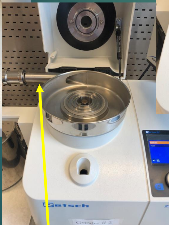
Tray with outlet